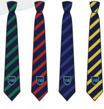
Y1-Y3 ELASTIC TIE Y4-Y6 FULL TIE