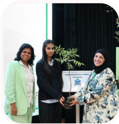
GEMS WINCHESTER SCHOOL, FUJAIRAH