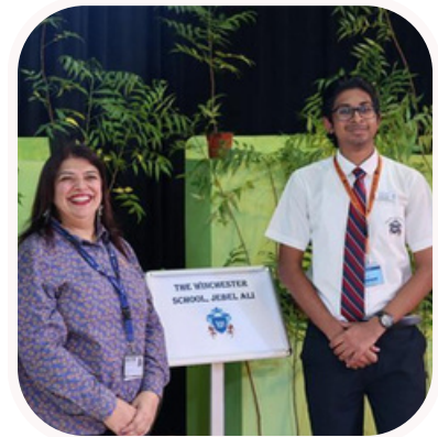
THE WINCHESTER SCHOOL, JEBEL ALI