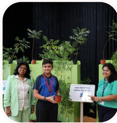
GEMS WINCHESTER SCHOOL, DUBAI LAND