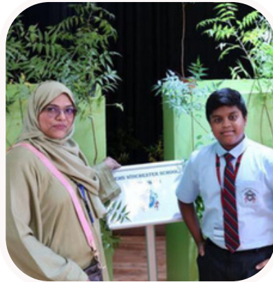
GEMS WINCHESTER SCHOOL, ABU DHABI

The guest schools arrived with their respective environmental leaders and coordinators for the green event.