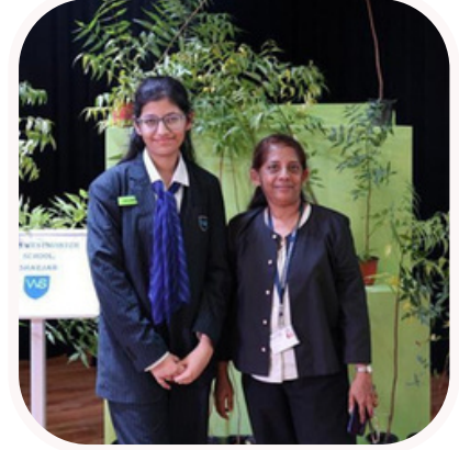
GEMS WESTMINSTER SCHOOL, RAS AL KHAIMAH